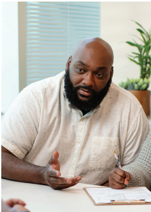
ANY PERSONS DEPICTED IN THIS ADVERTISEMENT ARE MODELS AND THE IMAGES ARE BEING USED FOR ILLUSTRATIVE PURPOSES ONLY

TRIUMPH-3 is a clinical research study for people with excess weight and heart disease. The study will test how safe and well the investigational medicine (the medicine being studied) works for weight management.