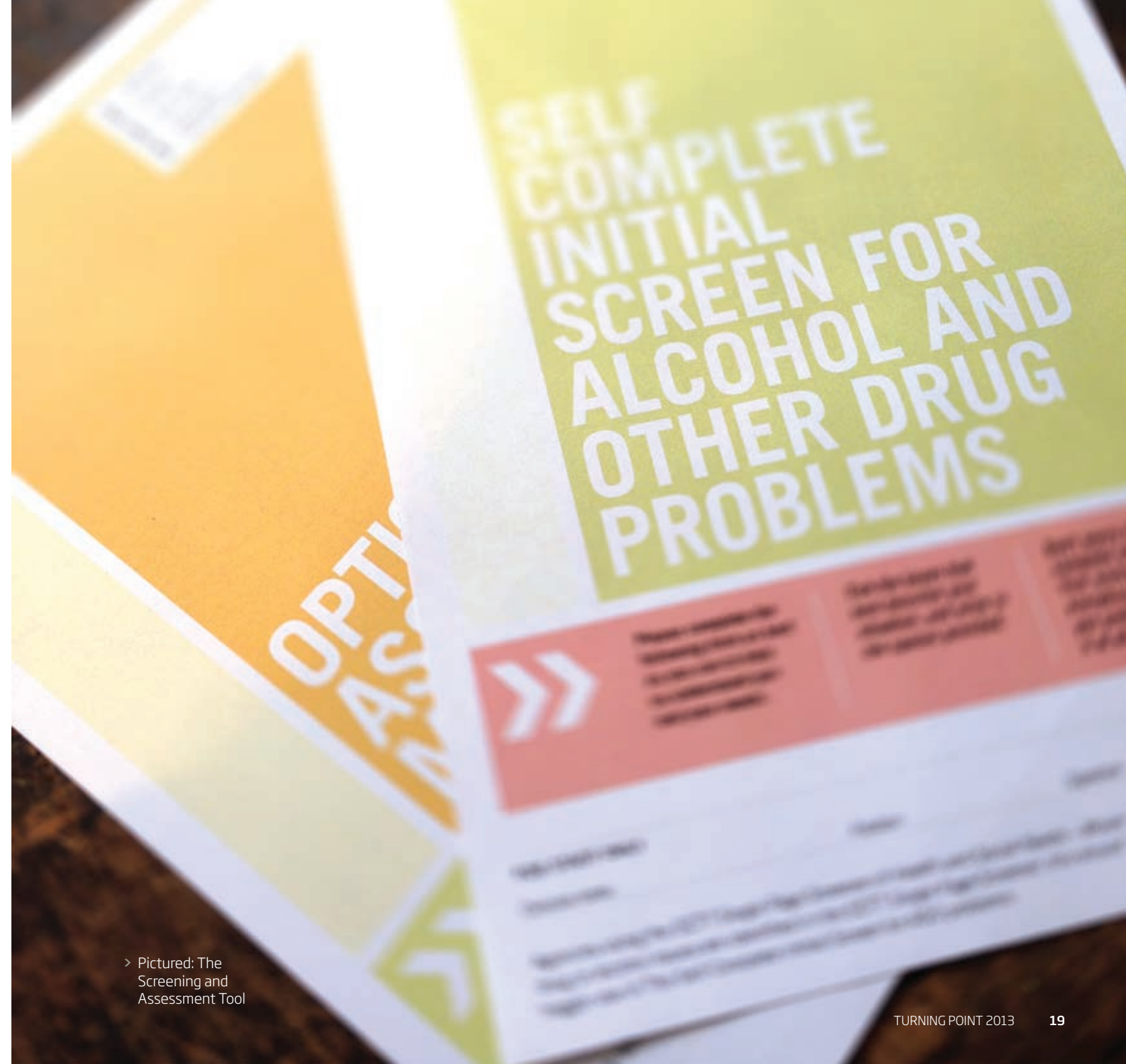
> Pictured: The Screening and Assessment Tool

The online version provides feedback and links to further support and an opportunity for the broader population to gain immediate feedback on their drinking and drug use.