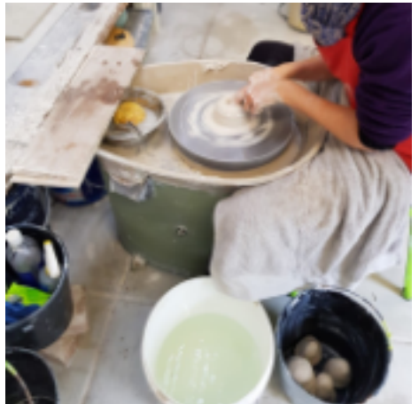
A pottery session.

For further information call 1300 MY VMCH (698624) .