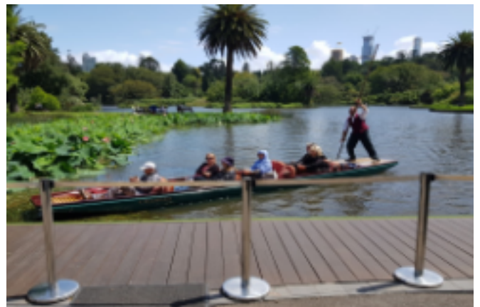
A gondola trip.