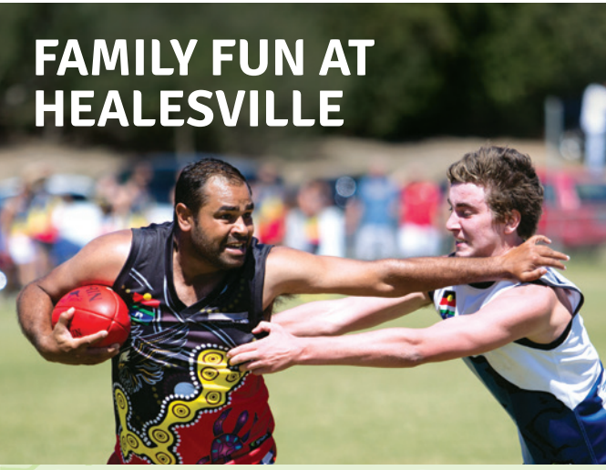
COMMUNITY FUN: Eastern Health is set to host its fifth Closing the Gap Family Sports Day on March 5.

To find out more about Eastern Health's Aboriginal Employment Plan and employment opportunities visit www.easternhealth.org.au or contact 9095 2491.