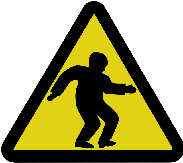
LEGS GIVE WAY