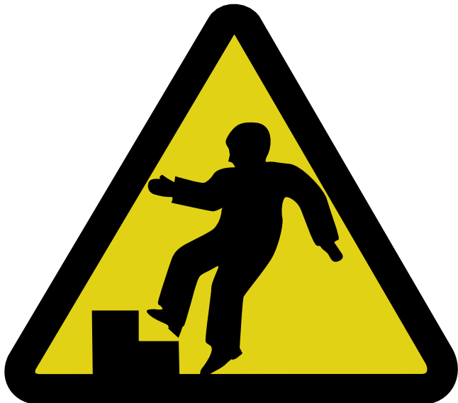
LOSING YOUR BALANCE