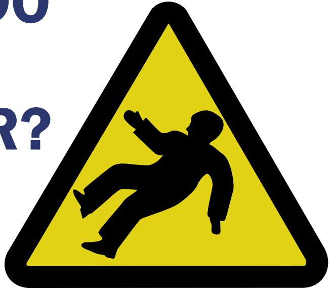
SLIPS & TRIPS